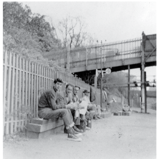
Operai italiani – Jolimont Station – 1956