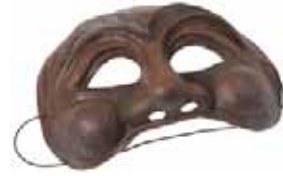
Commedia dell'Arte mask