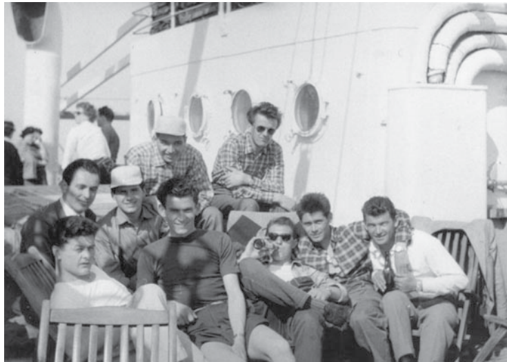
Travelling to Australia – May 1955